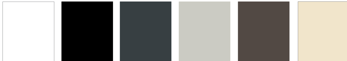
White (9910 high gloss) Black (9011 semi gloss) Grey (7016 matt) Silver Grey (7035 semi gloss) Brown (BS08-B29 semi gloss) Cream (1013 semi gloss)

Bi-fold doors can be coloured on one or both sides, and feature a matt or gloss finish depending on your chosen colour (other RAL colours available upon request):